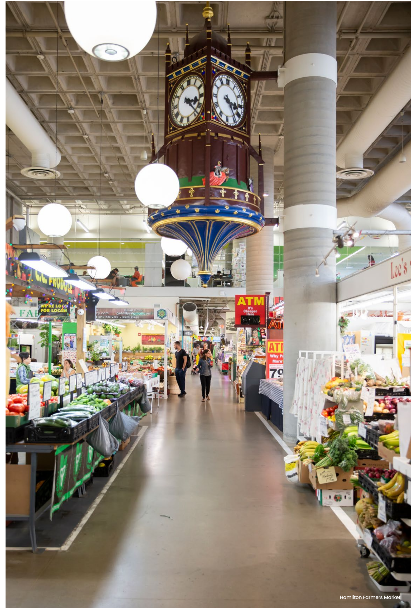
Hamilton Farmers Market