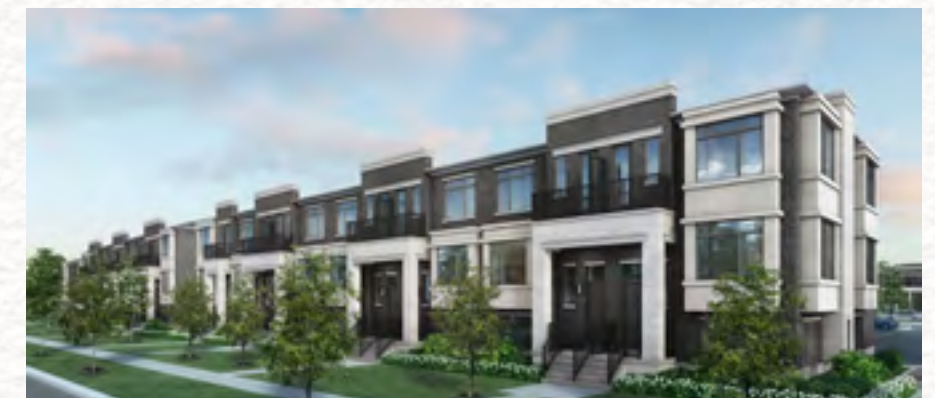
Renderings are artist's concepts. E.&O.E.