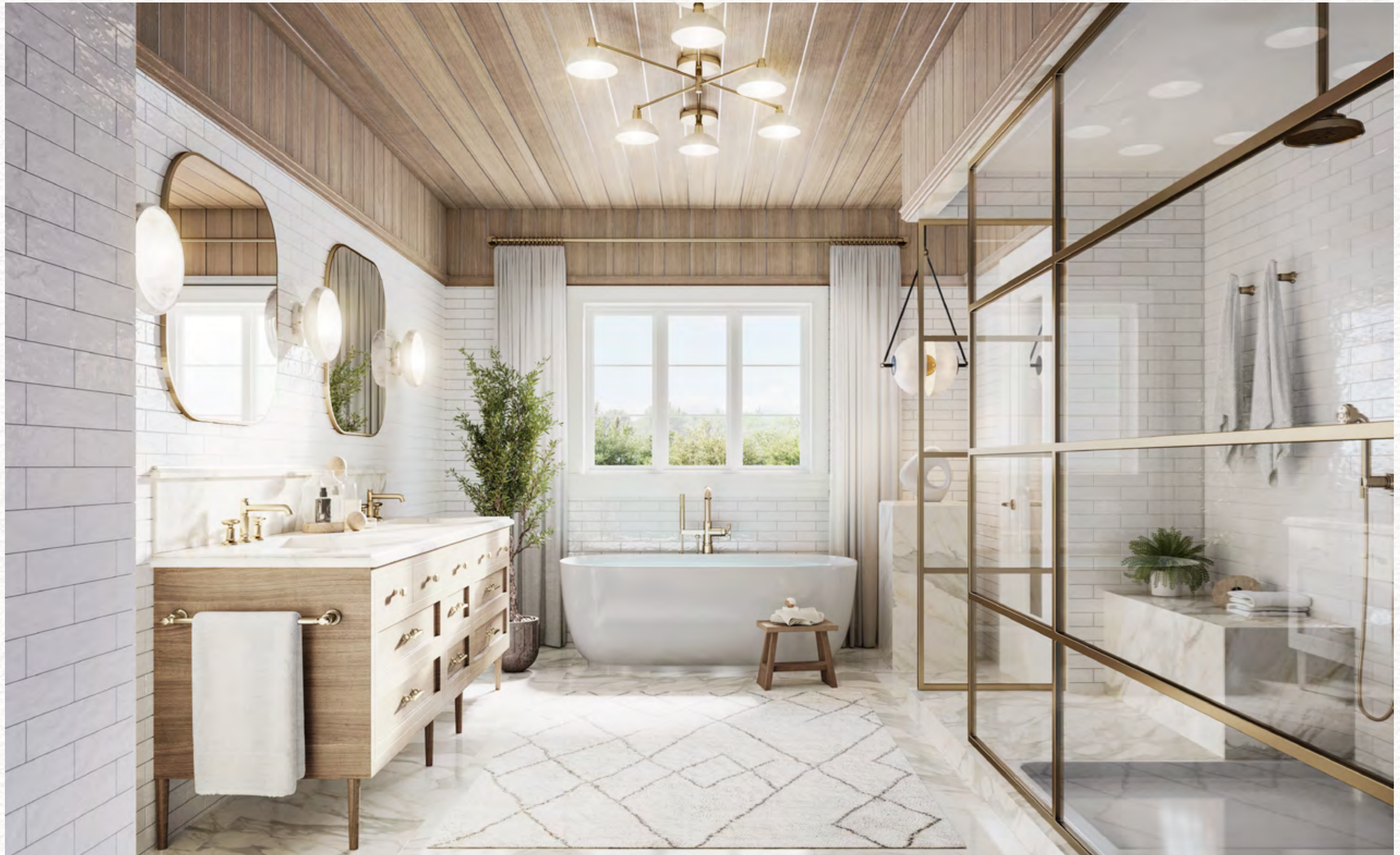
Rendering is artist's concept. E.&O.E.