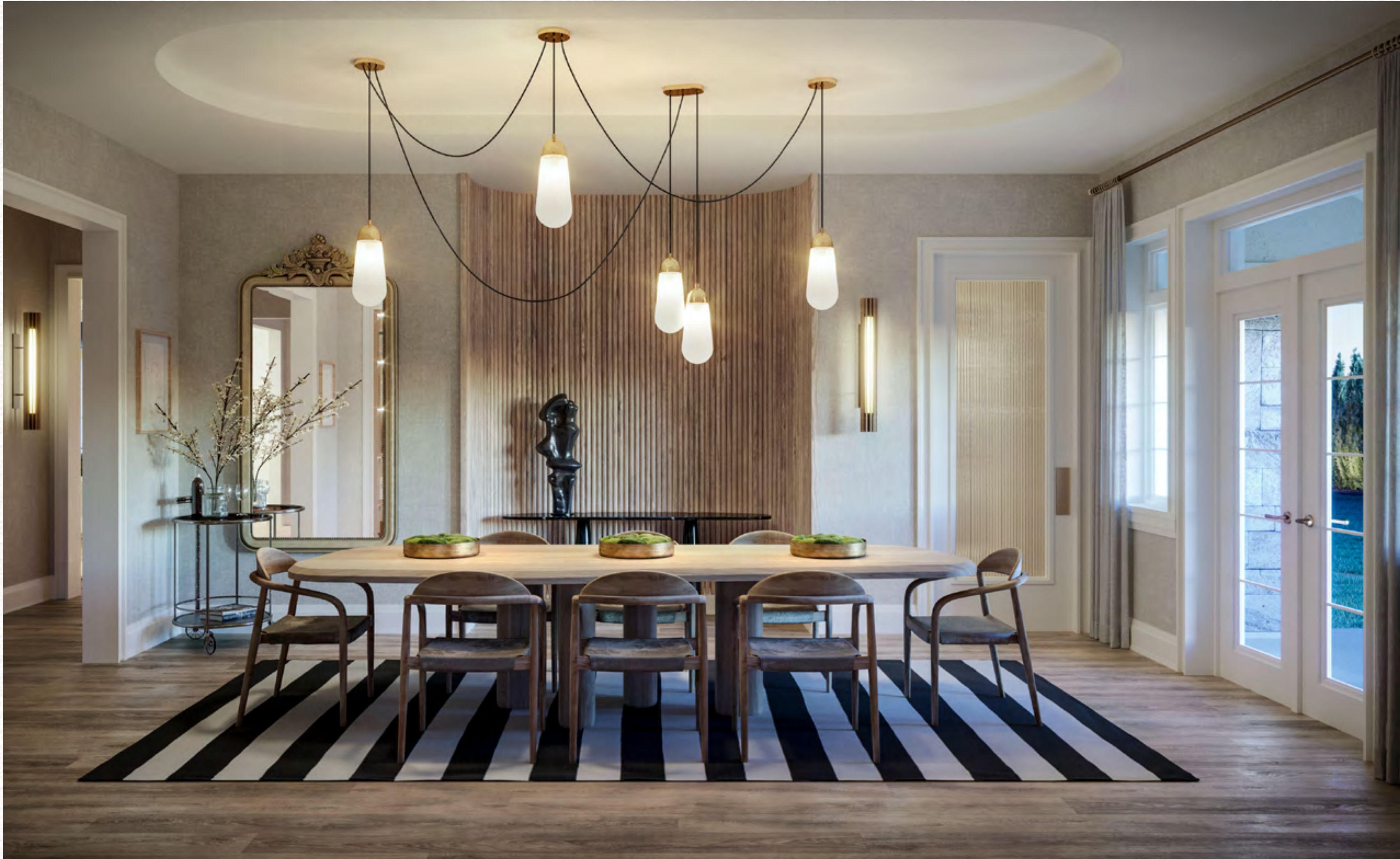
Rendering is artist's concept. E.&O.E.