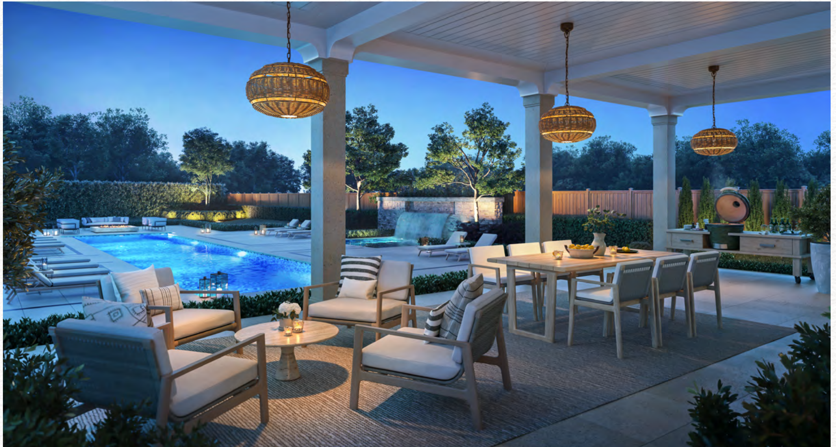
Rendering is artist's concept. E.&O.E.

Curate it to your whims and interests. From your own outdoor viewing theatre, relaxing swimming pool or outdoor pizza oven to a sprawling wildflower meadow for the birds and the bees, your garden is sized to accommodate the outdoor living space of your dreams.