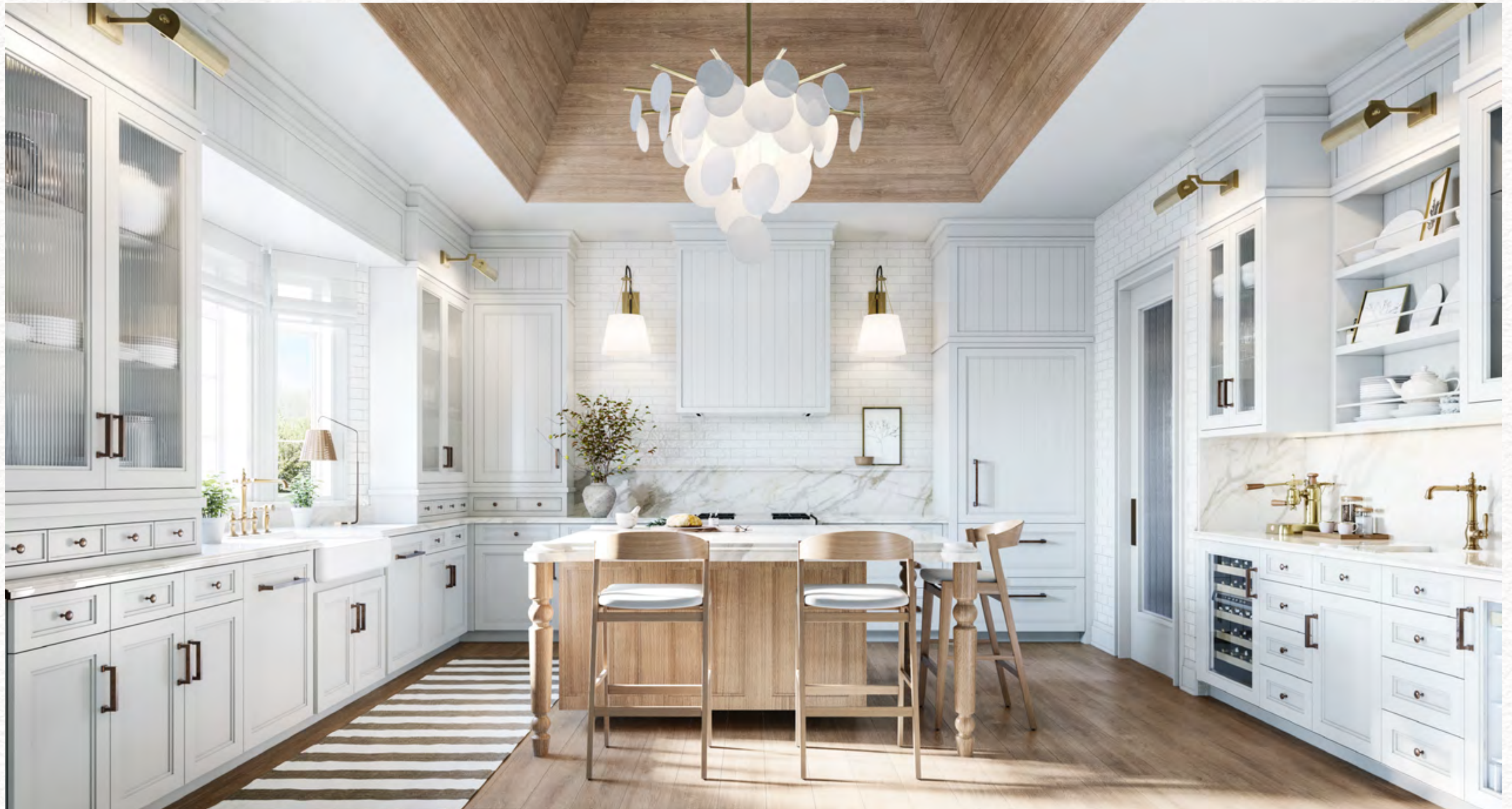
Rendering is artist's concept. E.&O.E.

Every element Treasure Hill has perfected comes to fruition at McMichael Estates. Every detail, nuance, every expectation that a homeowner has, is made manifest in a home designed, built and crafted, to stand the test of time and invested with the value of a residence that allows families to thrive in total luxury and comfort.