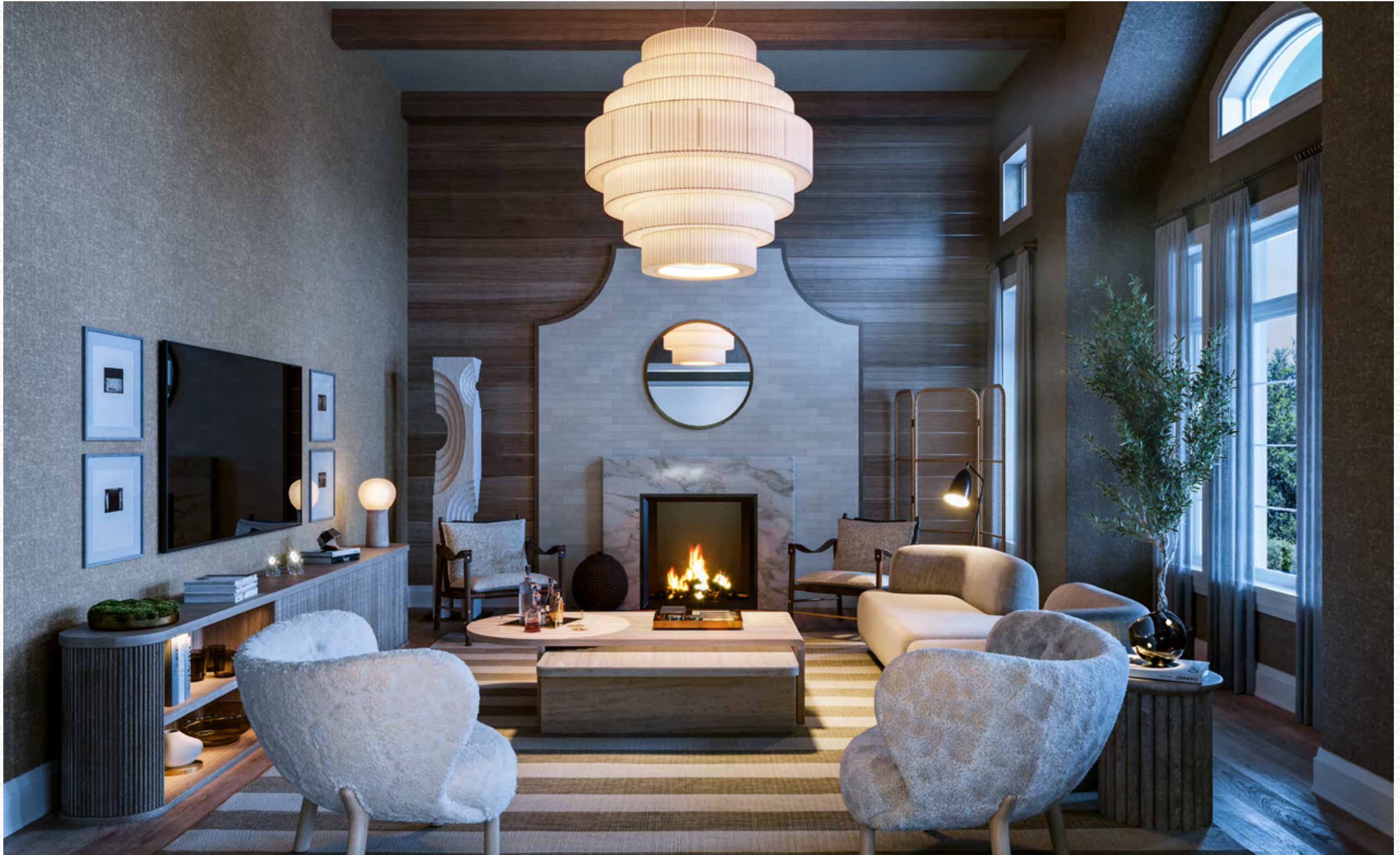
Rendering is artist's concept. E.&O.E.