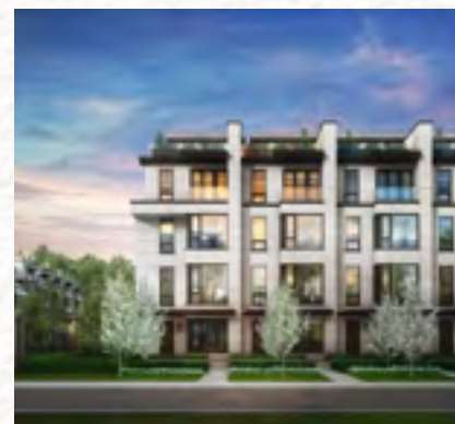
Rendering is artist's concept. E.&O.E.