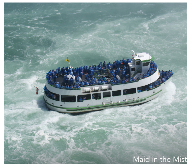
Maid in the Mist