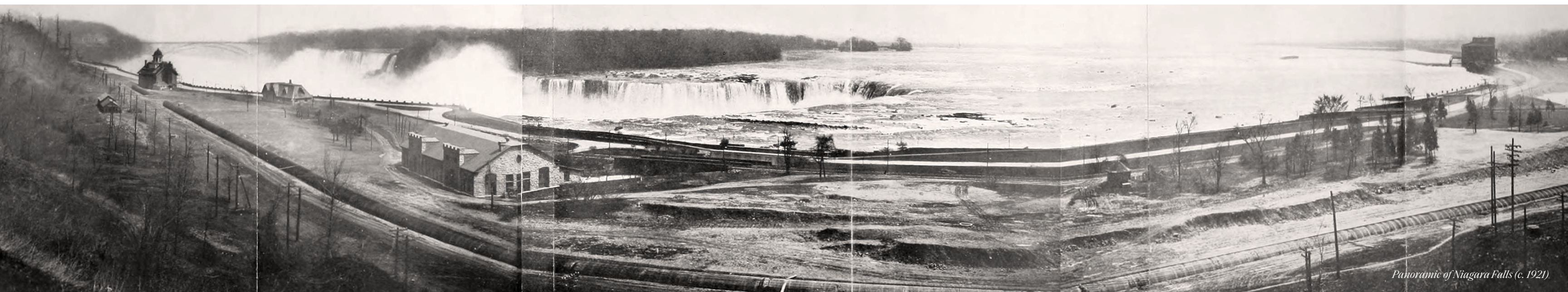
Panoramic of Niagara Falls (c. 1921)