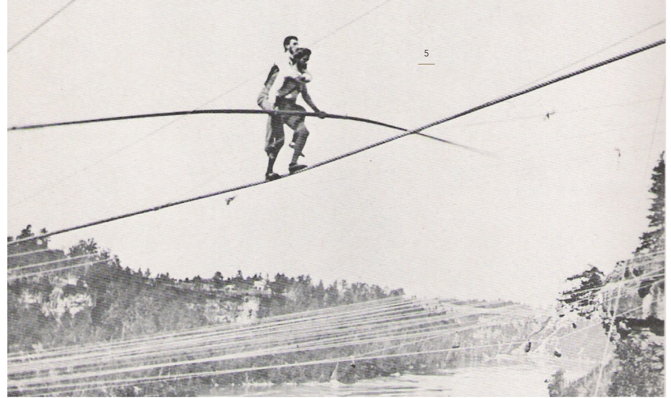
In 1859, French tightrope walker Charles Bonding carried his manager on his back across the Niagara River on a tightrope.

For many decades the Falls were an attraction for honeymooners and for such stunts as walking over the falls on a tightrope or going over them in a barrel. Increasingly, the appeal of the Falls has become its beauty and uniqueness as well as the incredible attractions that have grown throughout the area. Casinos, museums, parks and trails, hundreds of restaurants, entertainment, wineries, and night life thrive in Niagara Falls. Yet, the real draw to Niagara has always been the breathtaking Falls themselves. From the jagged raw power of the American and Bridal Veil Falls to the sheer volume of the Horseshoe Falls on the Canadian side, tourists come from far and wide to enjoy one of nature's best shows.