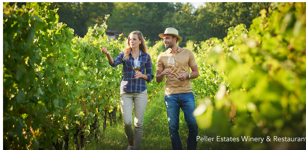
Peller Estates Winery & Restaurant