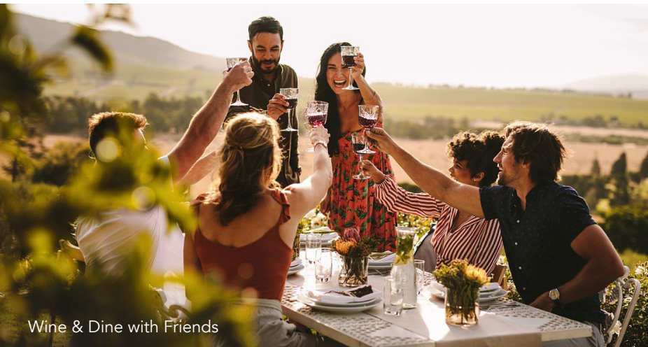
Wine & Dine with Friends

YOUR NEW DISTRICT WITH THE RIGHT AMOUNT OF INNER CITY COOL