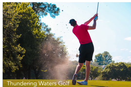
Thundering Waters Golf