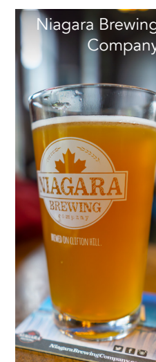
Niagara Brewing Company