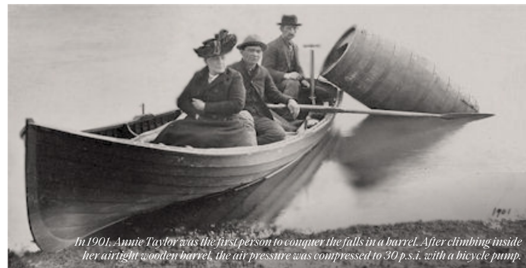
In 1901, Annie Taylor was the first person to conquer the falls in a barrel. After climbing inside her airtight wooden barrel, the air pressure was compressed to 30 p.s.i. with a bicycle pump.