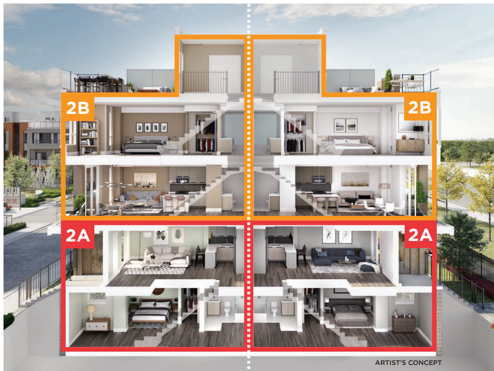
CROSS SECTION B