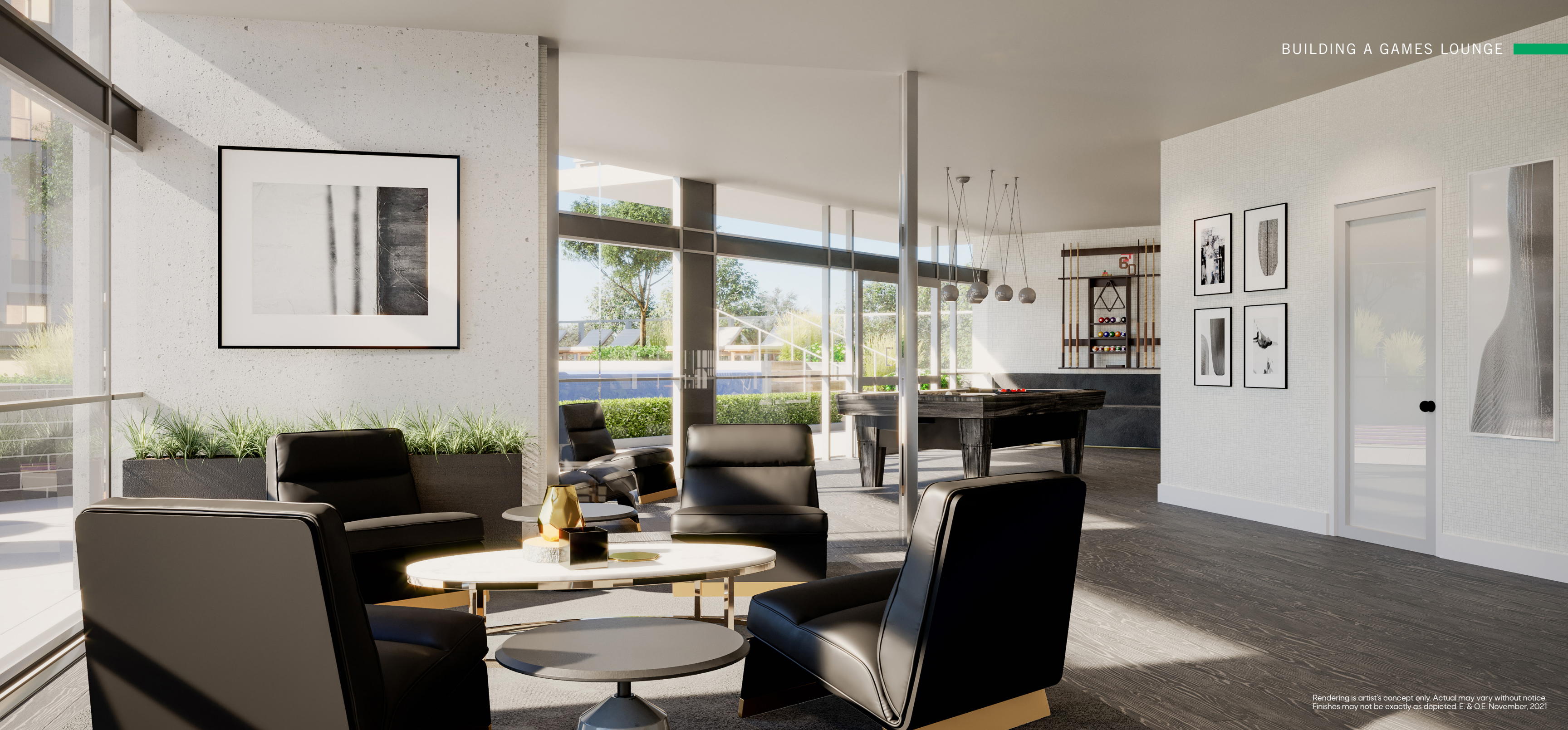
Rendering is artist's concept only. Actual may vary without notice. Finishes may not be exactly as depicted. E. & O.E. November, 2021