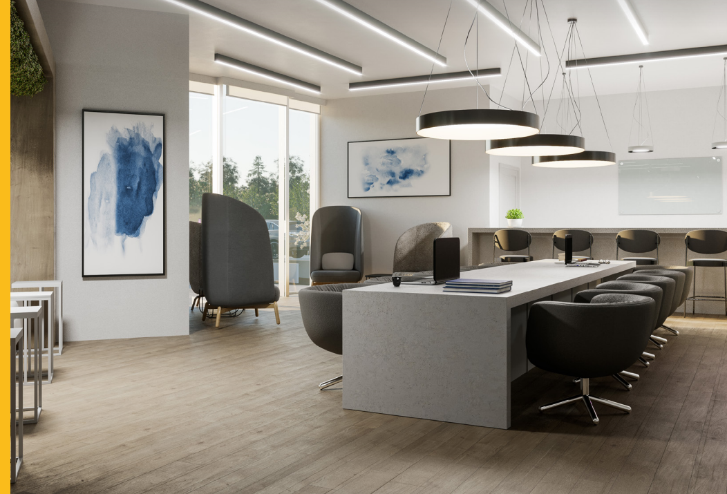
BUILDING A WORK STUDY LOUNGE